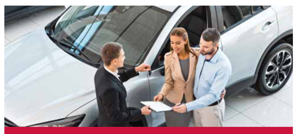
Throughout the New Car Code: